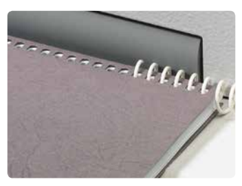
The simple to use rubber roller threads the coil through the document quickly and effectively.