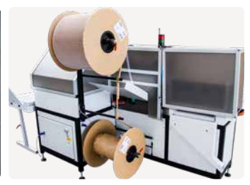
Spool de-winding with integrated paper separation re-winding