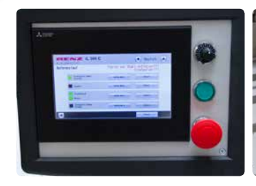
Menu-driven touch-screen control panel. Optional remote maintenance machine control module for remote diagnostics, software adaptations and connection to the internal company network.