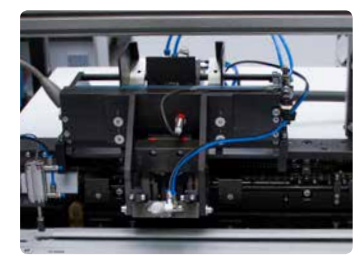
Station for forming and feeding calendar hangers