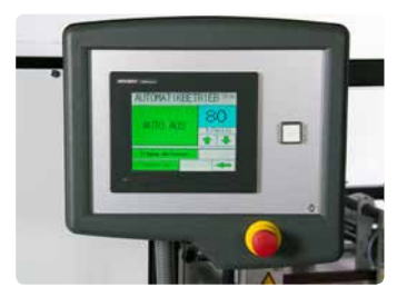
Digital touch screen display for setup and up to 40 job memories.