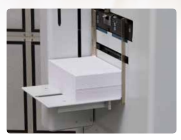
Deep pile feeder with high prestack capacity up to 4.000 sheets.