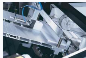
Collecting station for the binding carousel