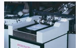
Feeder for oversized format