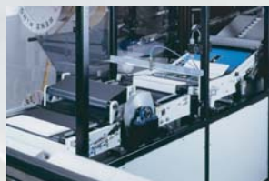
Cover turning device with cross delivery