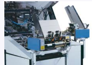
Single sheet feeder for pre-punched material