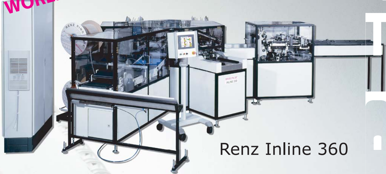
Renz Inline 360

Fully automatic punching and binding system for RENZ RING WIRE® comb binding