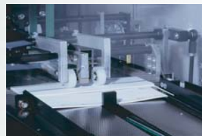
Separation of the blocks in piles